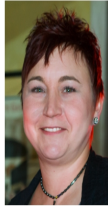
JAIME GARIEPY ROCK/POP